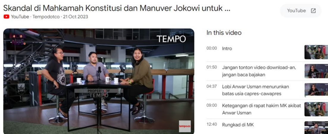
Figure 1. Table of contents of Bocor Alus Politik

BAP was first founded in 2023 by Tempo Media, a media group that has published Tempo magazine since 1971. In their website, the editor explains the purpose of creating BAP as a platform to provide political news that can be complicated and confusing simple and easy to understand by its audience, besides broadening the coverage of its readers (Tempo Media, 2023) They also claimed that they aimed at serving the public, and that they are an independent news agency, who rely on universal values such as democracy, justice, freedom of speech, equality, and pluralism.